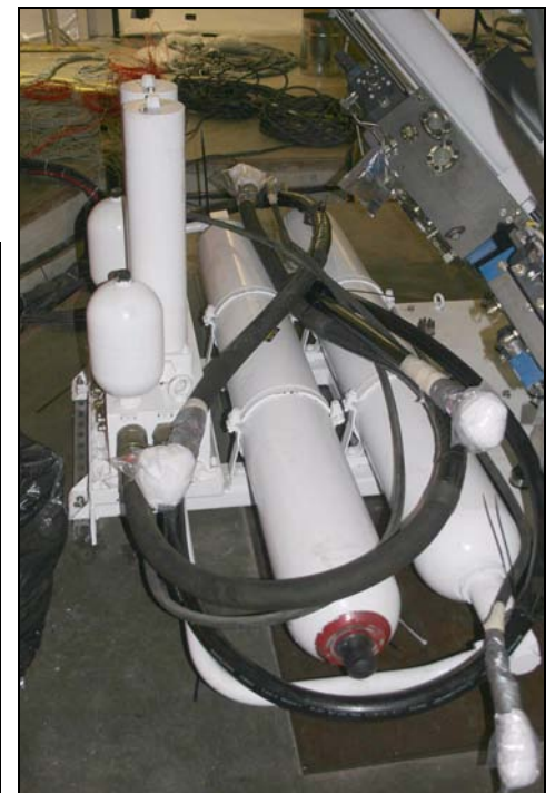
Preparing for a Simulator Move